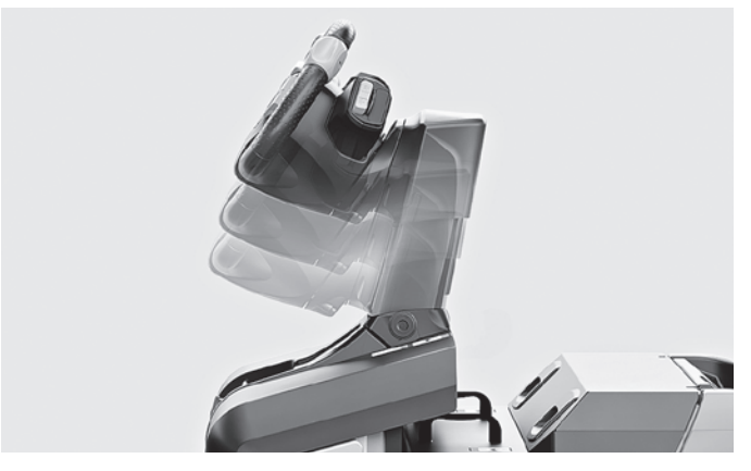
Optimal ergonomics owing to the height-adjustable steering wheel at a slight angle for individual operator preferences \,