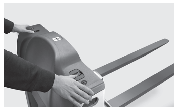
Order picking without strain on the back with the OXV 08 thanks to liftable order picking lift \,