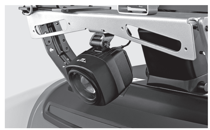
Optional STILL Safety Light for more safety and improved visibility of the vehicle