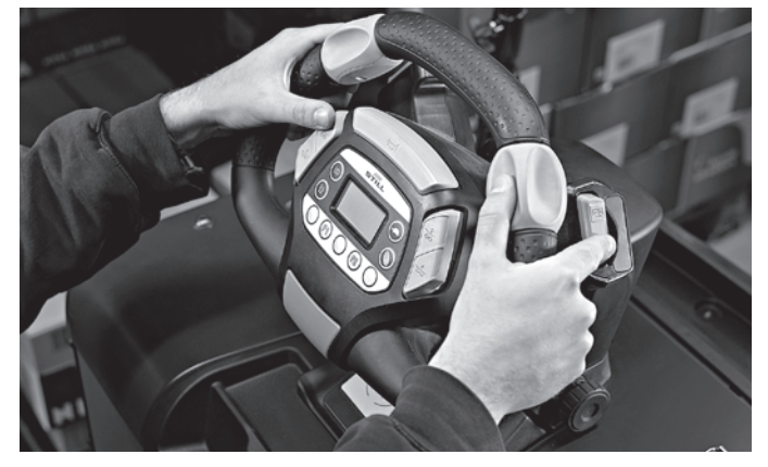
Unique STILL Easy Drive steering wheel ensures optimal driving response and allows users to operate all functions without changing hands