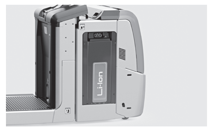
Always available thanks to optional lithium-ion battery