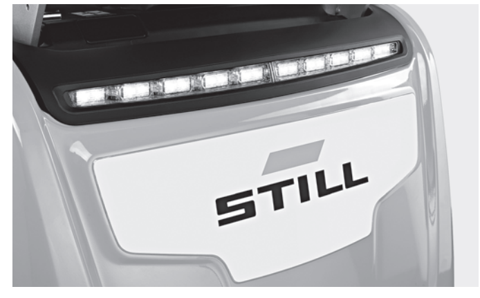
Intelligent LED daytime driving light improves the truck's visibility and also signals low battery status \,