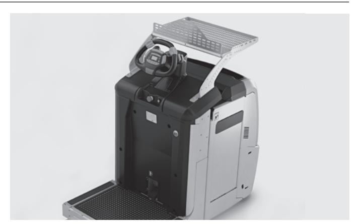
Optional order-picking tray for ergonomic, back-friendly work, e.g. as shown here OXV 07 \,