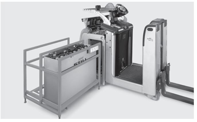
Always available thanks to lateral battery change