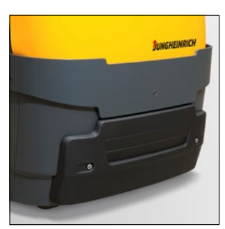
Solid rubber or steel bumper