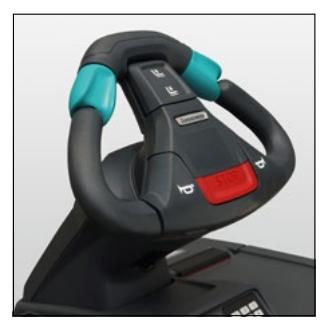
JetPilot – exclusive from Jungheinrich