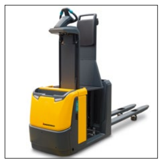
Lifting stand-on platform (HP-LJ) for 2nd level order picking (optional)